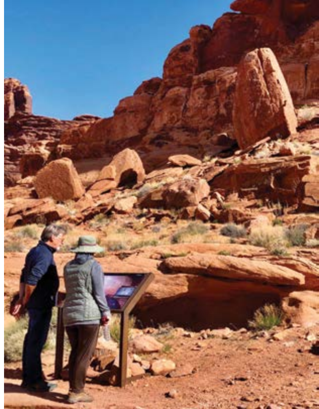
Rock Panel Info

of mudstone. And the silty pools and stepping-stone waterfalls and pour-offs are a refreshing delight in our arid environment. And, for hiking breaks, overhangs and cliff walls can offer shade at various times of day. I've hiked this trail dry, hiked it swampy, and recently had to turn