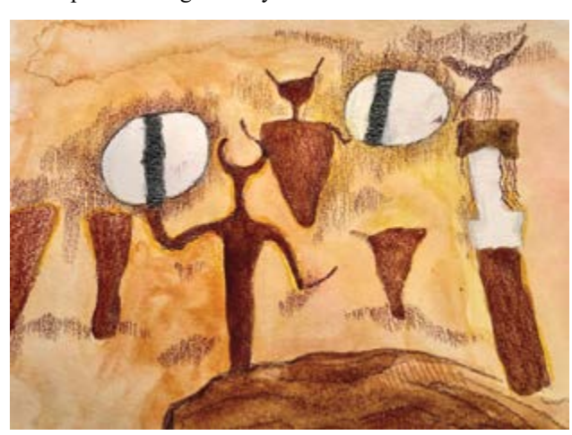
Watercolor painting of the Courthouse Wash Panel by Kathy Grossman

Your adventure can be enhanced—before, after, or on its own—by the artistry at the end of the Courthouse Wash Rock Art Trail, accessed by 1) following the wash trail and then walking east at the sign, or 2) following the bike path farther east and ascending a signed boulder-strewn path to the information board. Look for the imposing, westward-facing 52-foot-long wall of rock, 20 feet tall, with petroglyphs (carved or pecked) and pictographs (painted). The figures were created up to 2,000 years ago by ancestral Puebloan or Fremont-era peoples. Paiute, Ute, or Diné (Navajo) groups may also have added images. The original pigments have been dimmed from vandalism and subsequent cleaning, so I share a brightened detail of some of the panel's images in my watercolor illustration.